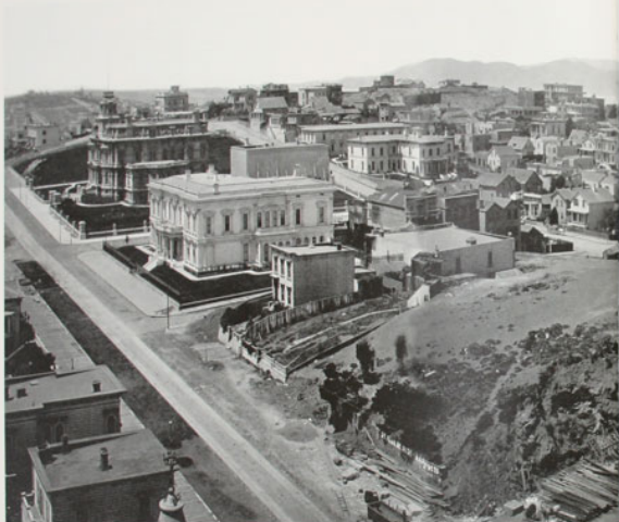
1870, San Francisco par l'Estward Rebuilding 1870, San Francisco by Eastward Rebuilding